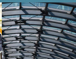
Structural steel and steel plate fabrication