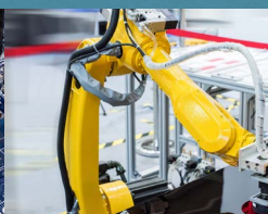
Custom equipment design and fabrication