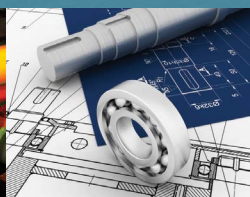
Engineering and Industrial services