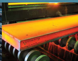
Heat and surface treatment