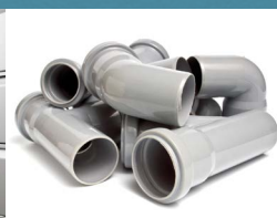
Plastics and Composites